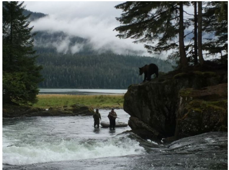
Brown Bear & Fishermen, Sweetheart Creek, Alaska